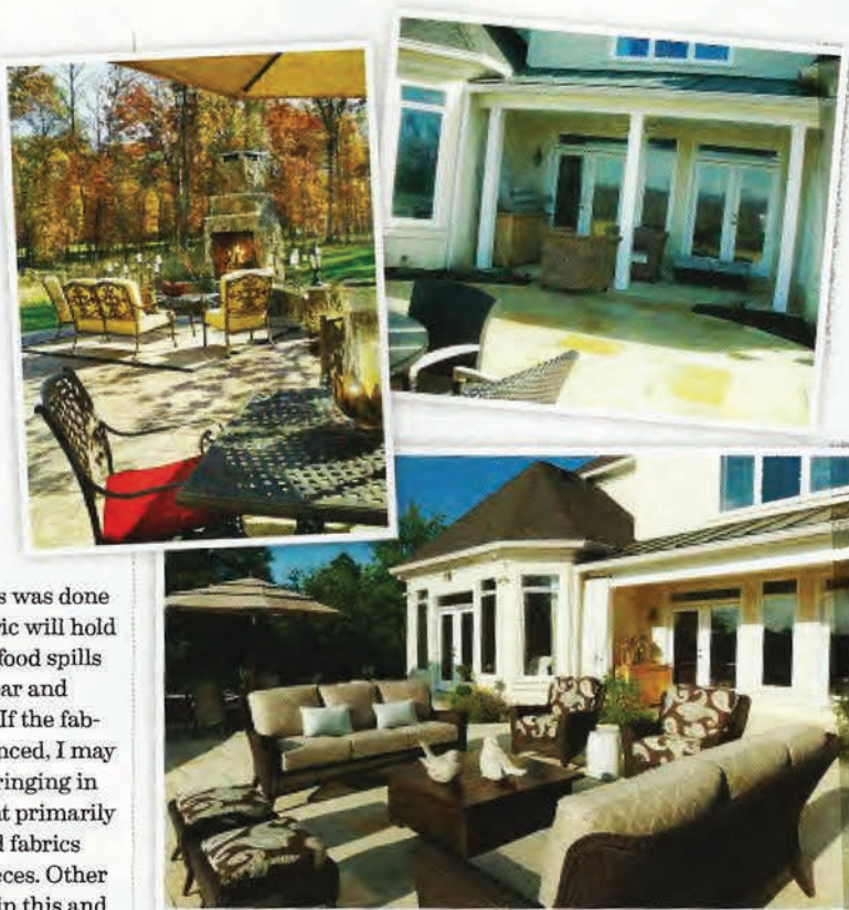
With a male homeowner and a tight deadline, Lauren Nicole Designs, Ashburn, Va, relied on outdoor fabrics to add interest and pop to multiple outdoor groupings.