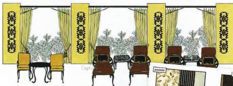
The depth of performance fabrics available enables Renee Meyer Interiors, Irvine, Calif. to coordinate interior and exterior décors.

The Baker Design Group attacked the project with attention to detail, especially in the