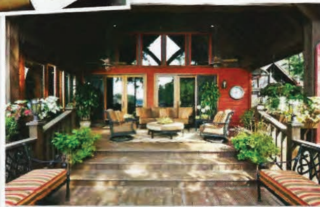
Performance textiles played an important role in the exterior décor plans for a lake home by Baker Design Group, Carrollton, Texas.

lows, was affected by the fabric sources we employed to get the job done."